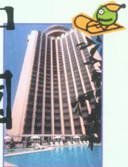
A fabulous hotel in Shenzhen!