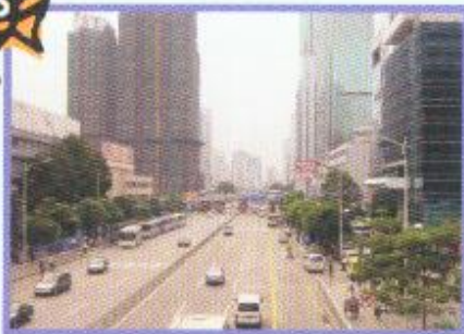
Shenzhen is becoming more commercialized!