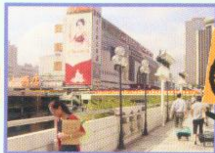
Shopping at the Luohu Department store!