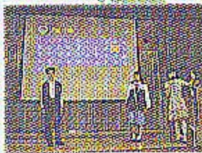
Participants at the Senior English Assembly

The junior and senior English assemblies were held respectively in November 2006. Teachers designed some interesting games and questions for students in order to promote English learning. Students could really actively participate in the activities.