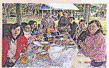
Exquisite Barbeque with homestay families, Yummy!

Senior students were organized to join a short-study programme in Southern Cross University (SCU) while the Junior students went to join the Sawtell School for an intensive English-speaking programme during the tour.