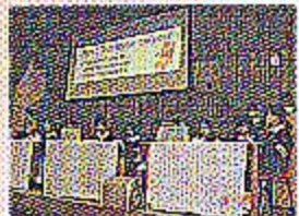
A contest among junior classes

The junior and senior English assemblies were held respectively in November 2006. Teachers designed some interesting games and questions for students in order to promote English learning. Students could really actively participate in the activities.