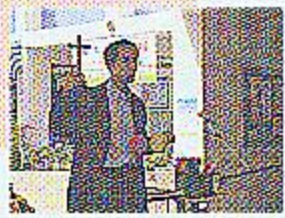
Sharing of Christ's love