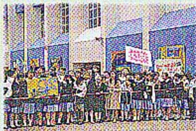
Energetic Cheering Groups