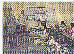
English class in SCU

Senior students were organized to join a short-study programme in Southern Cross University (SCU) while the Junior students went to join the Sawtell School for an intensive English-speaking programme during the tour.