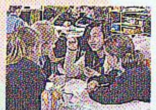
An international Conference