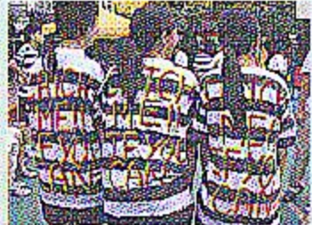
'Catch me if you can!' A slogan of the most creative team jersey

Thanks to teachers and students' donations, more than thirteen thousand dollars was raised from the Charity Campus Run this year.