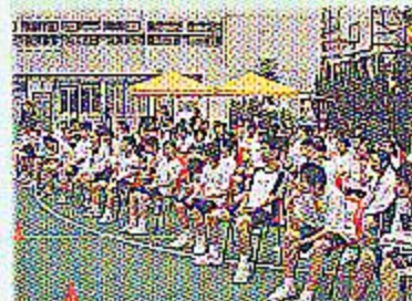
Athletes waiting for the race

Thanks to teachers and students' donations, more than thirteen thousand dollars was raised from the Charity Campus Run this year.